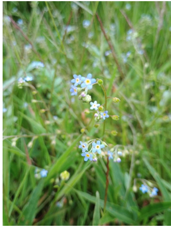
Clockwise from top: Honeybog Hill grassland including Meadow Buttercup, White Clover, Yorkshire Fog and Common Vetch; Tufted Forget-me-not; Northern Marsh Orchid