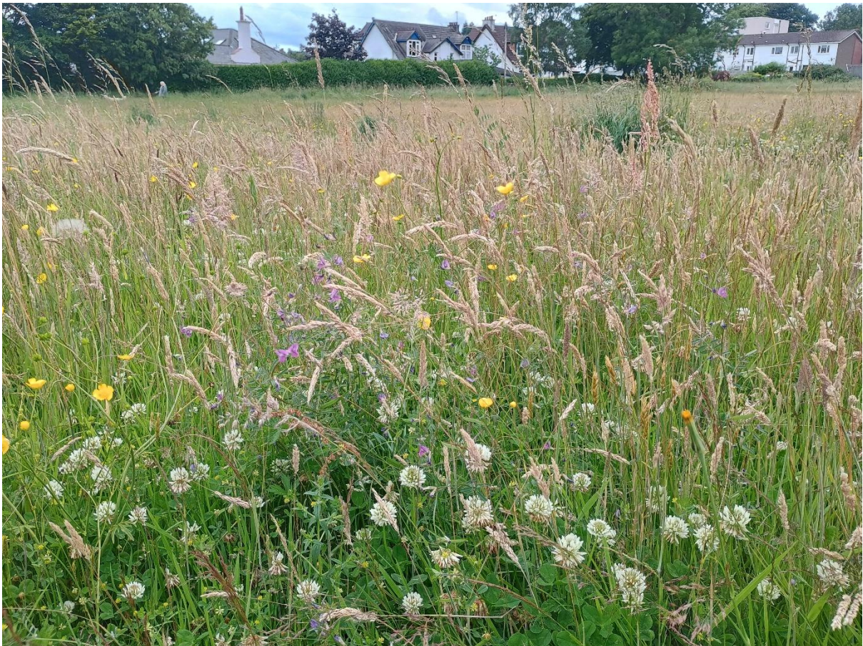
Clockwise from top: Chequered Pearl moth; Soldier Beetles; Grassland including White Clover, Yorkshire Fog, Red Bartsia, Broad-leaved Dock, Common Vetch and Lesser Trefoil