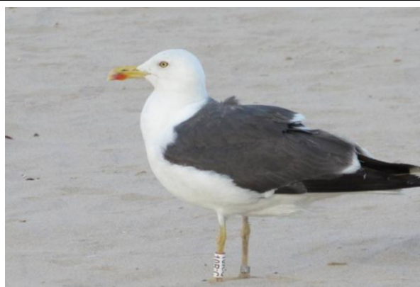
on the 7 th of August on Costa da Caparica beach, Portugal

On the 13 th of November Flyback moved inland to Youssoufia and has been travelling between there and Chemaia. Unfortunately we haven't had an update from his tag since the 13 th of November due to a network failure in Morocco however once he moves out of Africa we should regain contact with him.